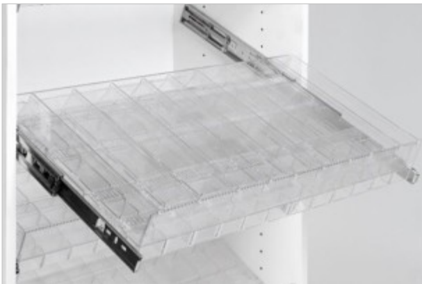
A tough polycarbonate shelf mounted on shelf support pins.