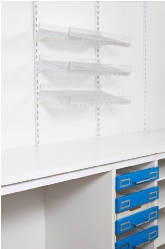
Multi angle brackets

The multi angle brackets and wall stripping can be mounted inside casework, over the top of a work bench either existing or newly installed or on a gondola.