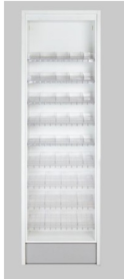
Shelf support pins

A tough polycarbonate shelf mounted on shelf support pins. Casework can be supplied by ErgoStor or the SMART SHELF can be retrofitted into existing casework with the correct dimensions (24 inch internal opening and 5 mm holes to support shelf support pins.)